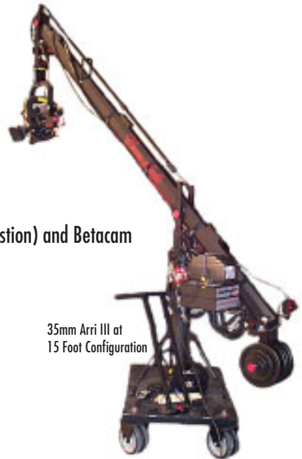
35mm Arri III at 15 Foot Configuration