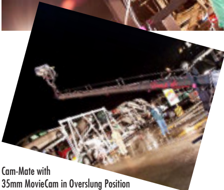
Cam-Mate with 35mm MovieCam in Overslung Position