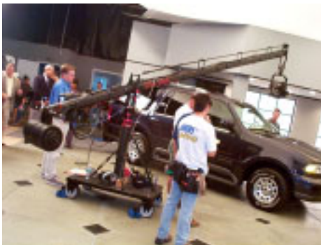
35mm MovieCam at 21 foot configuration