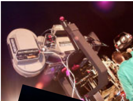
Cam-Mate with 35mm MovieCam in Overslung Position