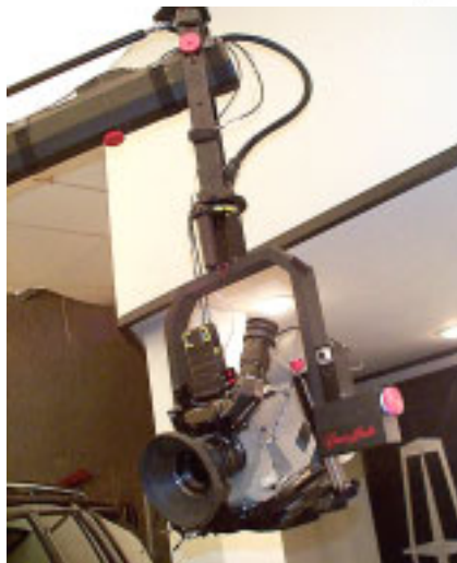
Cam-Mate with 35mm MovieCam